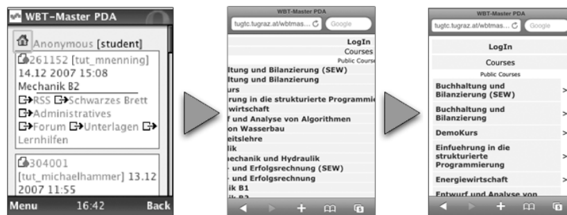
Fig. 2. Usability issues found necessitated restyling of the mobile LMS interface to support different interaction mechanisms

The study revealed usability issues on different layers, violating the principles discussed previously. The fat-man , for example, occurred as the interface forced the user to use excessive zooming and scrolling on all parts of the site (see fig. 2), and a fixed page width was used that resulted in very small text. Also in some parts of the system the gap between links was too small to be used with a touch screen, which can be seen as a further application of this principle. A frustrating constriction for the free-bird was the automated "first-letter-big" function of the iPhone when logging into the system, as the login was case-sensitive and it was not permitted to store the login code. The one-hand-bandit appeared in the form of confusing lists and forum post, with difficult to understand structures.