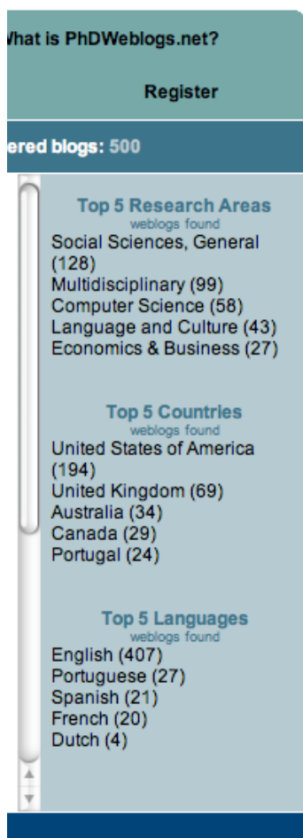
Fig. 2: phd-Weblogs

On "PhDWeblogs.net" there are a lot of PhD weblogs from different categories from all over the world: